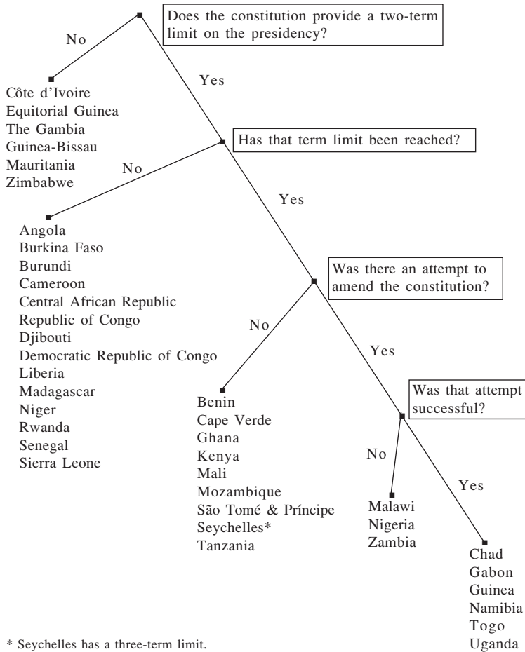
FIGURE 3—PRESIDENTIAL-TERM LIMITS IN AFRICA, 1990–2005

region. In the 1960s and 1970s, it was commonplace for leaders who wanted to perpetuate their rule to have themselves declared “president for life”—as did the Central African Republic’s Jean-Bédél Bokassa (who later promoted himself to “emperor”), Equatorial Guinea’s Francisco Macías Nguema, Ghana’s Kwame Nkrumah, Malawi’s Hastings Kamuzu Banda, Togo’s Gnassingbé Eyadéma, Uganda’s Idi Amin, and Zaire’s Mobutu Sese Seko. Today that option would appear to be closed.